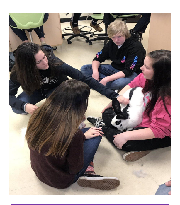
Animal Science class learning about small animals