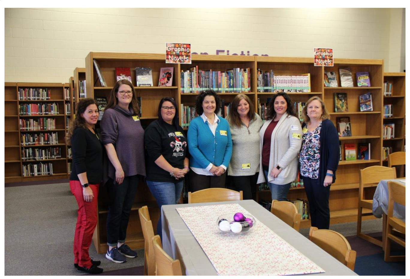
Thanks to the PTO for providing lunch for our PRHS Staff!!