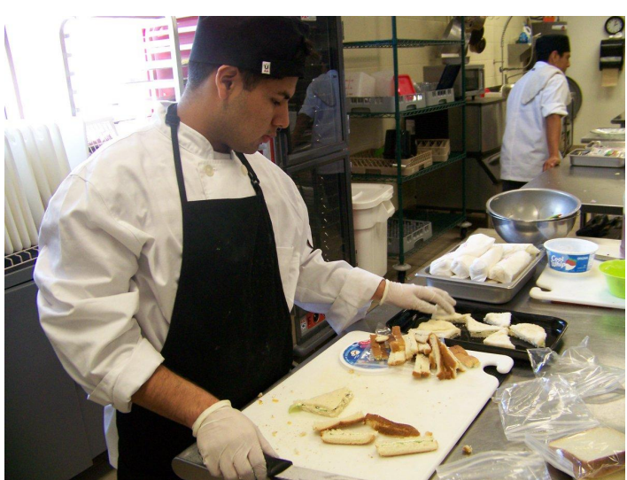
Culinary Arts Class making sandwiches for Sandwich Day!!